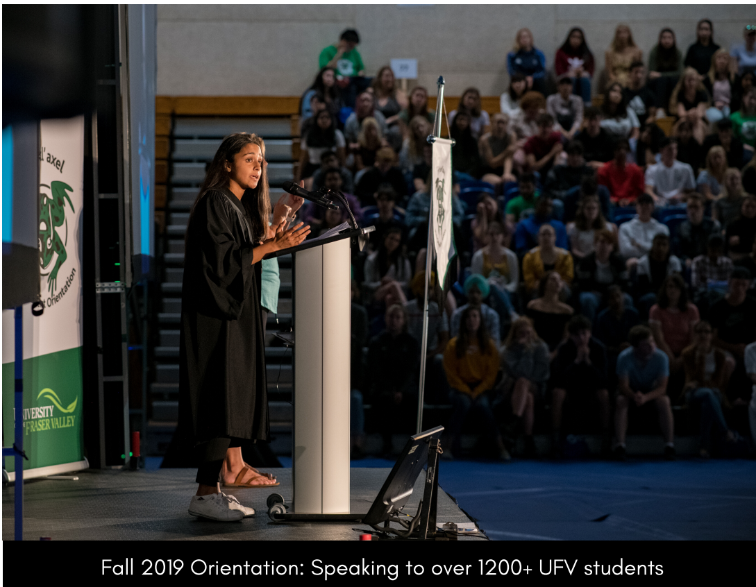
Fall 2019 Orientation: Speaking to over 1200+ UFV students

I am a student advocate who continuously defends the rights of students and want to continue serving you by being on the SUS Board. Already being the student representative on the UFV College of Arts Council , I will transfer my knowledge and experiences gained on this council to the SUS Board as the College of Arts representative. As the current SUS President, I have represented students on a provincial and federal level. As well, I have gained many skills and experiences that will help me contribute rich ideas to the SUS