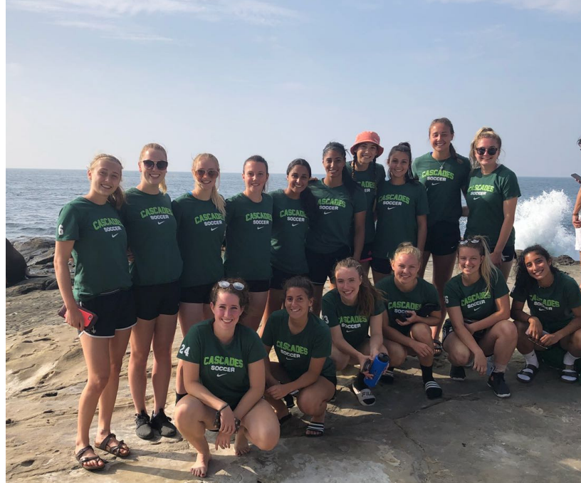
Representing UFV all the way in 📍 San Diego, California