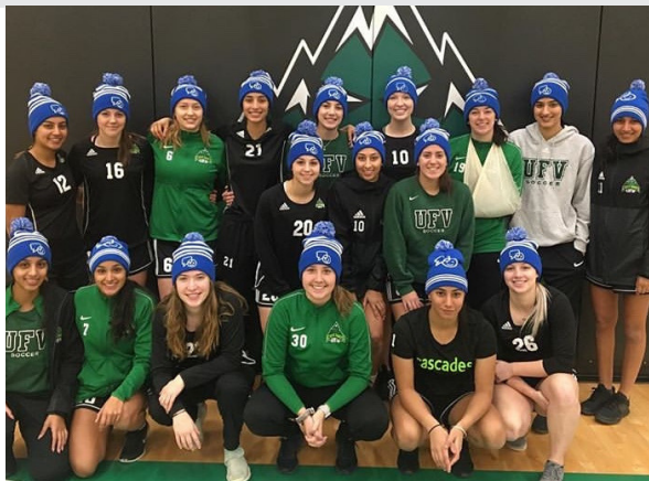
Bell Let's Talk: Supporting mental health