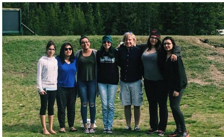
SUS Executives and Officers for the 2016-2017 term