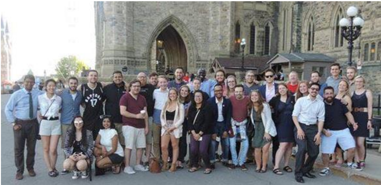
Canadian Alliance of Student Associations (CASA) Foundations Conference (2016-2017 delegates)

On May 26 th , a new CASA Board of Directors was elected to lead the organization for the upcoming term. CASA Committee memberships were elected and approved on May 27 th . UFV has membership on the Trades and Tech Committee (TTC), the National Advocacy Team (NAT), and the Graduate Committee for the 2016-2017 term.