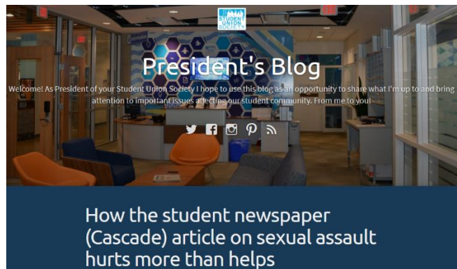
Inaugural SUS President's Blog post (Posted: May 24 th , 2016)

The SUS President's Blog went live on Tuesday, May 24 th ( https://suspresident.wordpress.com ). The purpose of this blog is to bring attention to important issues affecting the UFV student community and to share what I am up to throughout the term. The inaugural President's Blog post addresses the feature story on campus sexual assault that was published by The Cascade in April. [The content of this blog post was cross-published in the May 25 th edition of The Cascade ].