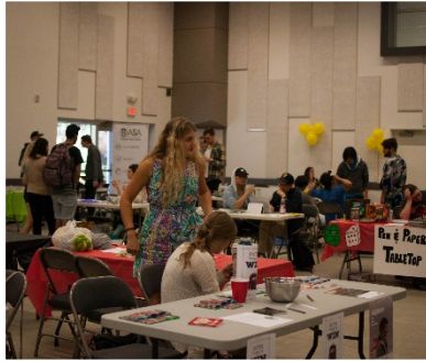
C&A Week, Fall 2017