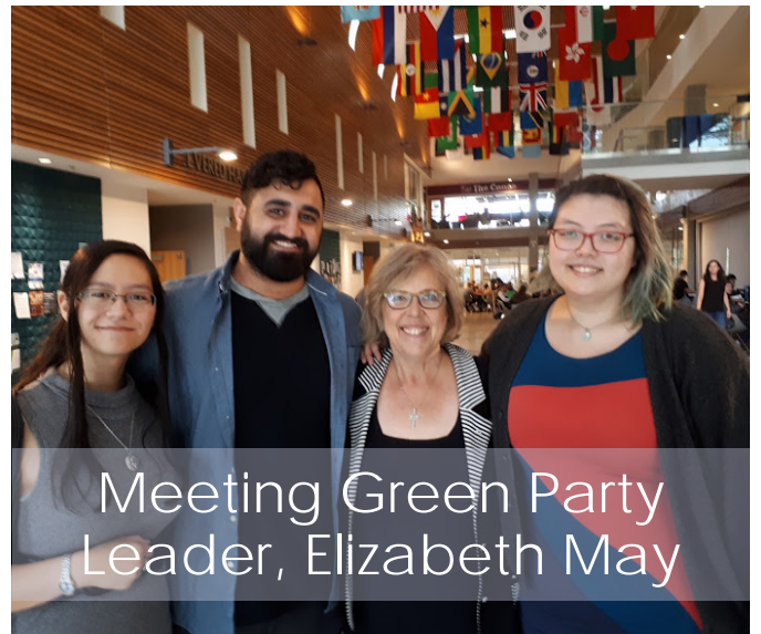
Meeting Green Party Leader, Elizabeth May

It's been great to engage with Canadian government at the provincial and federal level!