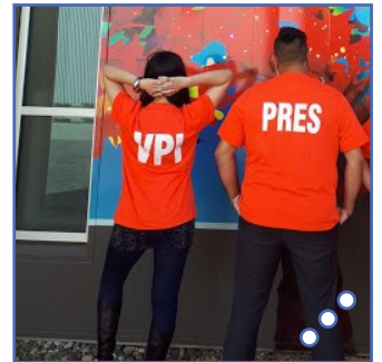
○ Serving pancakes at Fall Orientation 2017