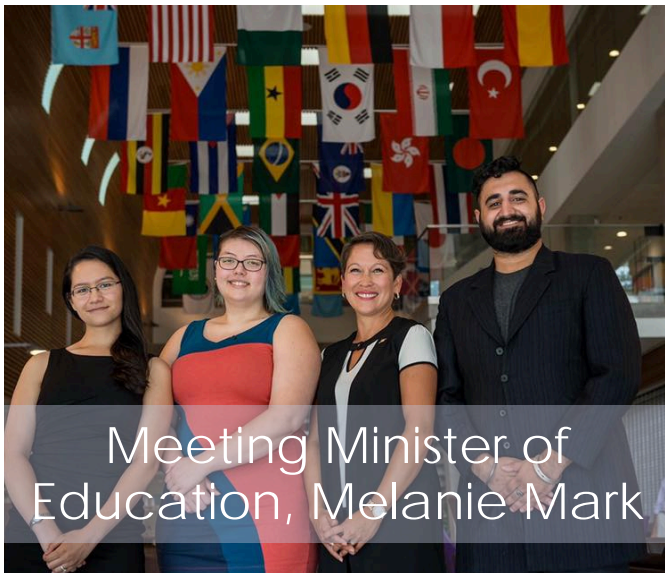
Meeting Minister of Education, Melanie Mark